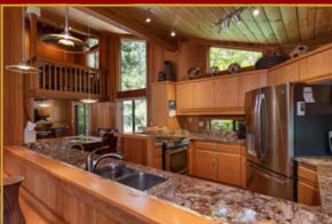
Updated kitchen with granite counters and stainless appliances