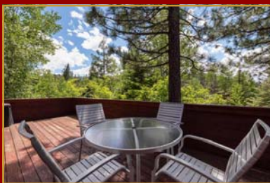
Large private deck for outdoor living and summer enjoyment