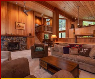
Open great room/living area with newly upgraded granite fireplace

3 bedroom, 3 bath, 2 car garage and approx. 2,118 sq. ft.